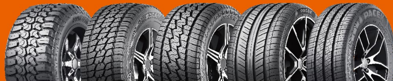
FORTRAK M/T TOLEDO ZIVARO A/T PC10 PC08