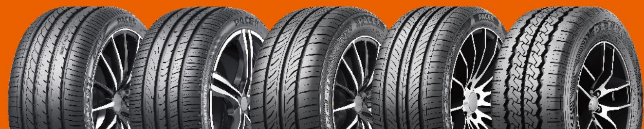
ALVENTI IMPERO PC50 PC20 PC18